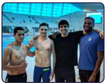
The fabulous London Aquatic Centre hosted the first London Regional Masters Championships in March. 20 Otters competed in an event that we hope becomes an annual affair!