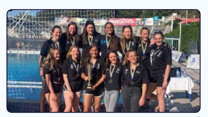
Otter at the Club EU Nations in Prague

To kick off the 2019/2020 season Otter flew their newly-formed side out to Prague to compete in the club EU Nations. With only one loss by one goal in the whole competition, the team managed to finish third after beating an impressive Slovakian team.