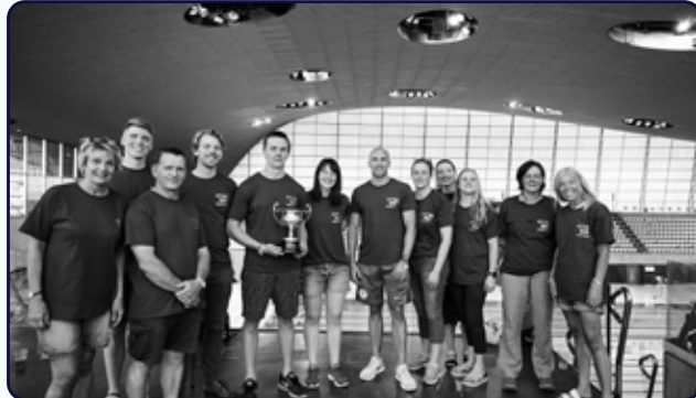
The champions Team South

Following the swimming, competitors retired firstly to the pop up bar overlooking the LAC diving pit to enjoy some competitive water polo matches while we congratulated ourselves on swimming well done with a glass of something chilled.